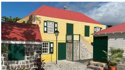
The Hill Coumpound St. Statius